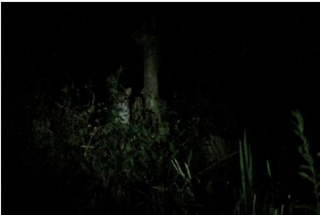
Bengal cat observed in Kuta Male during the night monitoring