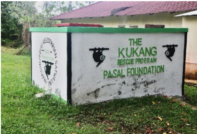
New waterwork with biological wastewater treatment plant