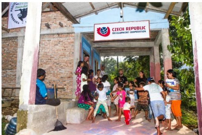
School at the End of the World

i.e. a community of farmers producing the conservation coffee and thus protecting endangered animals. This application was also approved at the end of 2019 and its content will be the main purpose of our work with communities in 2020.