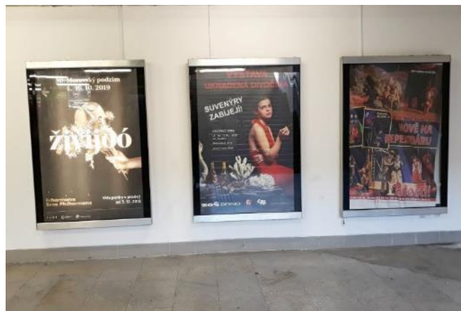
Poster on the Stolen Wildlife Exhibition in Brno Zoo