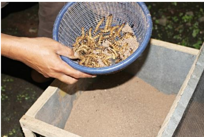
Reared larvae of Zophobas morio

Furthermore, the insect farm was expanded, producing a large number of worms. In order to provide slow lorises with the best food possible, we breed darkling beetles ( Zophobas morio ) in our farm. We sell excess larvae of this species on the local market as food for birds and invest the money earned from the sale back into the farm.