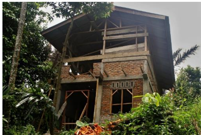
Construction of the School at the End of the World

In addition, the grant supported the establishment of the so-called “English-Environmental Clubs” (EEC) for youth who meet and discuss various current environmental issues facing Indonesia. In addition, in three key partner villages of Bandar Baru, Kuta Male and Basukum, environmental education was expanded and supported, schools and libraries have been equipped with furniture, notebooks, a projector and other teaching materials, and children have acquired new school uniforms. Furthermore, the “Kukang Coffee” project was launched. This project is based on the production, processing and sale of conservation coffee from the Kuta Male community and the involvement of local farmers in the protection of endangered animal species. You can learn more about this project in the chapter “Cooperation with local communities in Sumatra” below. A big thank you goes to the Embassy of the Czech Republic in Indonesia and especially to the Deputy Ambassador Jakub Černý for his support during the grant implementation. Following the successful completion of the SSP 2019 grant, an application for the next year, SSP 2020, was filed at the end of October. This time, this application was mainly aimed at supporting the establishment and operation of the so-called “Kukang Coffee Community”,