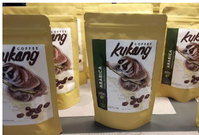
First samples of the “Kukang Coffee” brand

In the area of Kuta Male, in addition to working with the community, we continued in the monitoring of the current situation of the local slow loris population and evaluation of the habitat for future pilot release of rehabilitated slow lorises, including the selection of a future spot for a habituation enclosure.