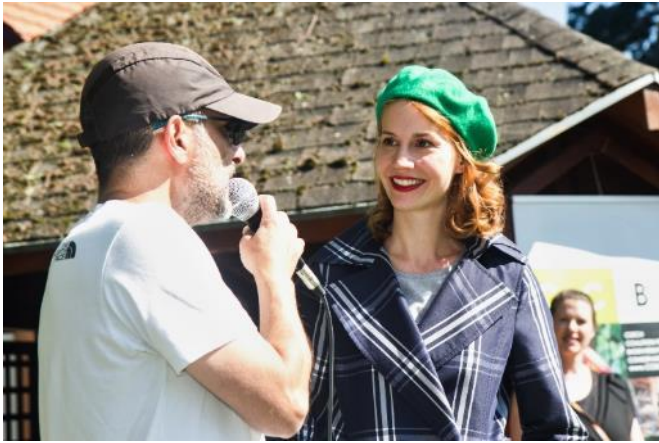
Fashion show of actors at the event FOR A MOMENT WITH KUKANG