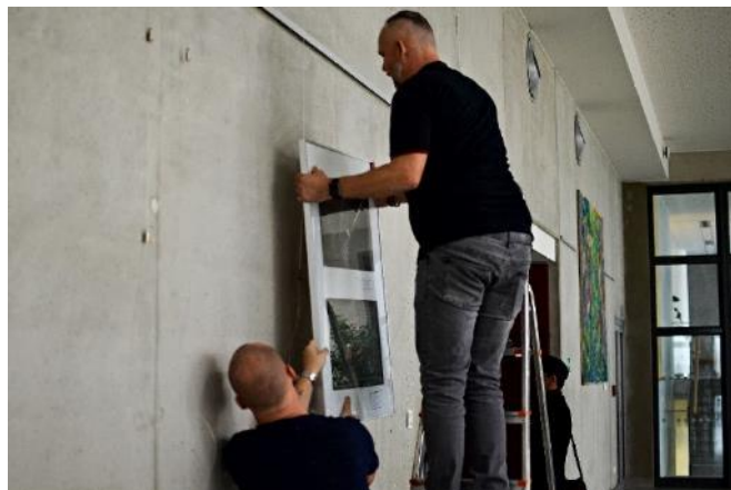
Preparation of the exhibition of photographs by Lucie at CULS in Prague

Today, social networks are an important tool for sharing information and raising awareness. Therefore, in 2019, an Instagram account of The Kukang Rescue Program was established. This account can be found at: https://www.instagram.com/kukang_program/