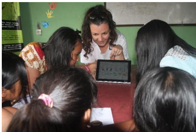
English-Environmental Club for youth