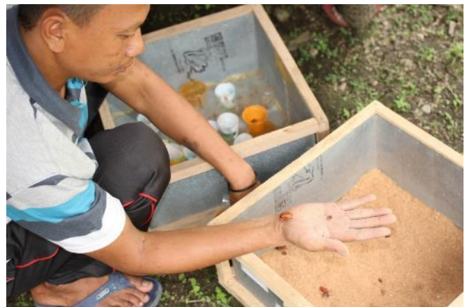
Breeding of a new generation of Zophobas morio

In 2019, also other modifications and improvements took place in the rescue and rehabilitation centre. One of them was the filling of the pond located in the administrative part of the centre next to the offices. This pond serves partly for fish breeding and partly as a natural habitat for wildlife and plants. The pond provides safe access to water, shelter, food and breeding area for the local fauna. As a result, even an otter was seen in the pond. In 2019, other activities contributing to increasing the biodiversity of the whole area were systematically developed. Pools, wetlands and other water-retaining places were created in the centre area in order to slow down the water runoff from the landscape. Several dozen flowering and fruiting plants and trees were planted. In addition, we preserved several dead and fallen trees and their trunks as places for living, reproduction, and as