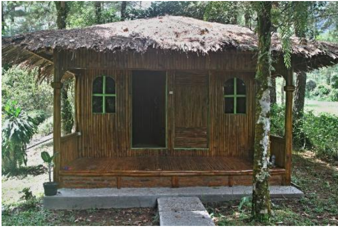
New pondok for animal keepers