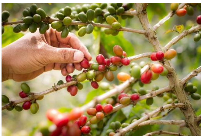
Harvesting the first beans of the “Kukang Coffee”