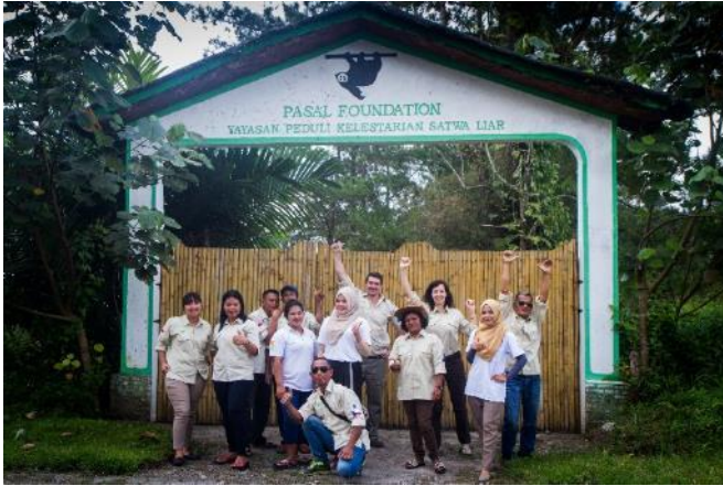
Indonesian Kukang team in the rescue centre

As every year so far, in 2019 the Kukang team succeeded in recruiting new members both in Sumatra and in Europe. The Indonesian team does a good job and is regularly supported by the work of a large team, mostly from the Czech Republic, but also from some other European countries. One of the main goals of the program is to build an Indonesian team which will deal with most conservation activities related to slow lorises and other animals. You can have a look at how this Indonesian Kukang team looked like in 2019 in the photos below.