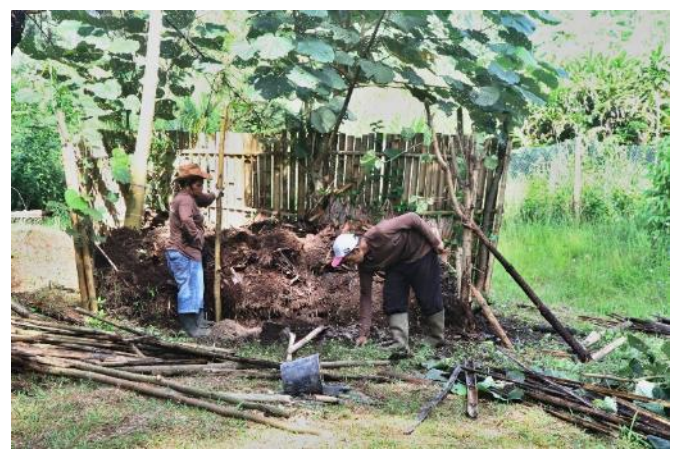
Repair of the compost in the rescue centre