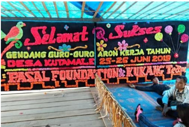
Kukang team supported the harvest festival in Kuta Male

There was a lot going on in 2019 and this report is a summary of only the most important events. Even more plans and new projects are being prepared for the coming years. In addition to the “Kukang Coffee” project, it is worth mentioning the planned international Memorandum of Understanding (MoU) between the Czech Republic and Indonesia on nature conservation and sustainable development. Representatives of The Kukang Rescue Program discussed this MoU in Indonesia together with representatives of the Embassy of the Czech Republic in Indonesia and representatives of the Indonesian Ministry of the Environment and Forestry, as well as in the Czech Republic at the Czech Ministry of the Environment with Deputy Minister of the Environment Smrž, other key people of this ministry, with the Ambassador of Indonesia in the Czech Republic and her Secretary, but also with colleagues from the Liberec Zoo and the Czech Environmental Inspectorate.