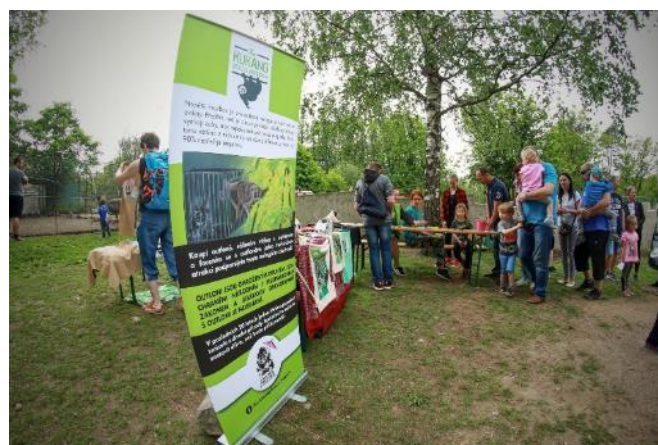
Children Day in Zoopark Na Hrádečku