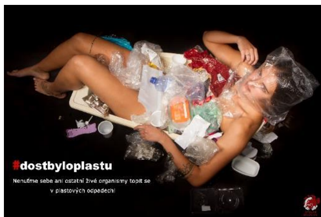
Awarded photo by Lucie “Enough of the Plastic!”