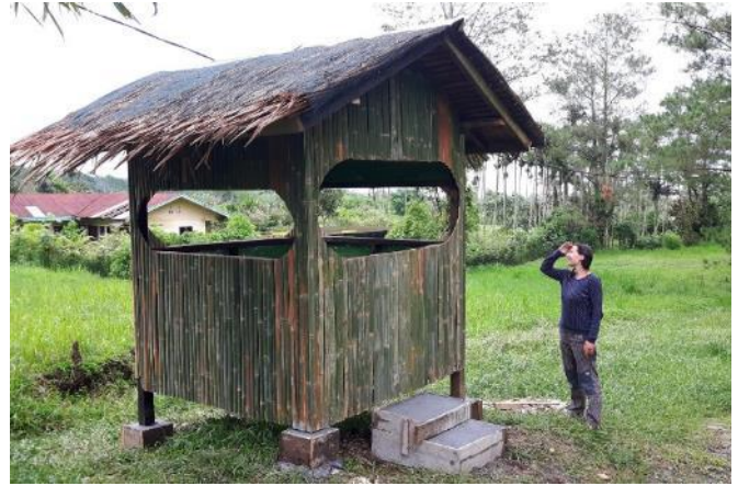
New pondok for the night watchman