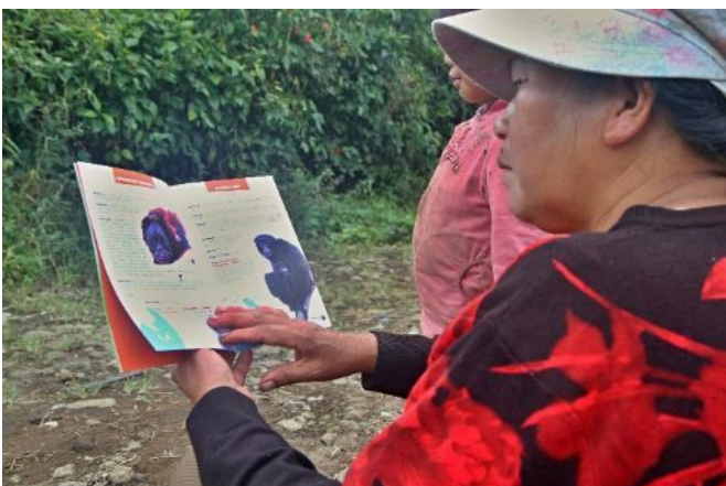
Brochure in the hands of a farmer from Tongkoh