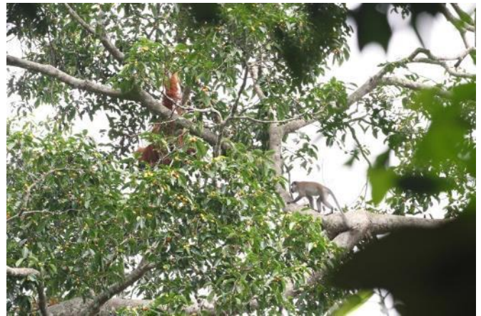
Sumatran orangutan and long-tailed macaque jointly feeding on a ficus