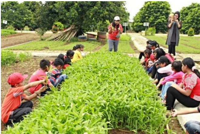
Visit of the botanical garden in Medan