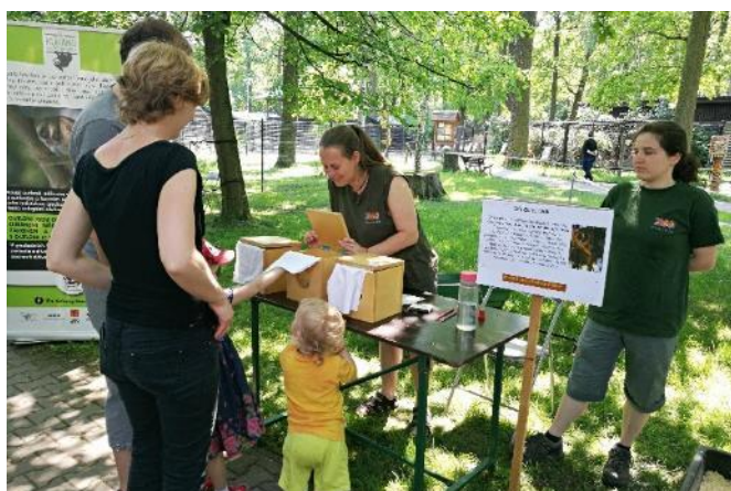
Children Day in Hodonín Zoo