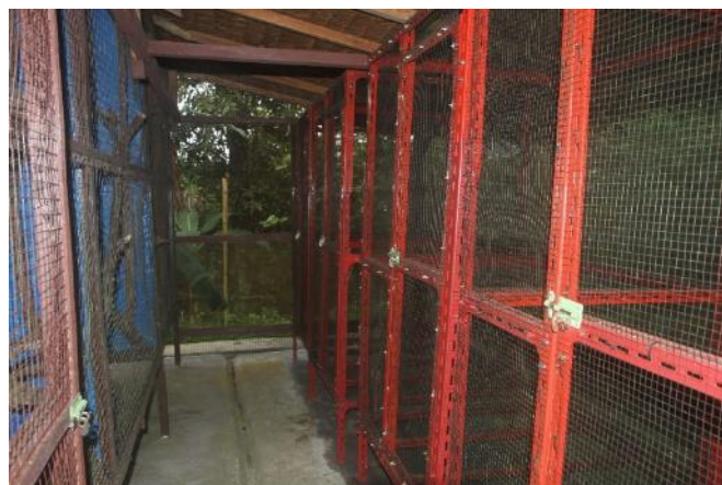
New enclosures in the slow loris quarantine