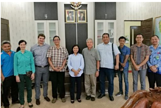
Meeting with representatives of BBKSDA and Indonesian Association of Zoological Gardens and Aquaria (PKBSI)

In January 2019, the Indonesian foundation Yayasan Peduli Kelestarian Satwa Liar (PASAL Foundation), which runs activities of The Kukang Rescue Program in Indonesia, and the local government agency BBKSDA North Sumatra under the Ministry of the Environment and Forestry of Indonesia jointly approved and created a final draft of a new Memorandum of Understanding (MoU) in the conservation of small mammals of Sumatra. Implementation of this agreement was expected to start in 2019. Unfortunately, several bureaucratic traps emerged during the year due to new laws and regulations that showed that the PASAL Foundation would have to receive letters of recommendation from Jakarta not only from the Ministry of the Environment and Forestry, but also from the Ministry of Foreign Affairs and the Ministry of Justice and Human Rights. The initially anticipated three-month process turned into a several-month bureaucratic struggle full of meetings and negotiations with these ministries. The resolution of this situation and the final signing of the Memorandum of Understanding, loosely translated as “Cooperation on the Conservation of Small Mammals of Sumatra”, are expected during 2020.