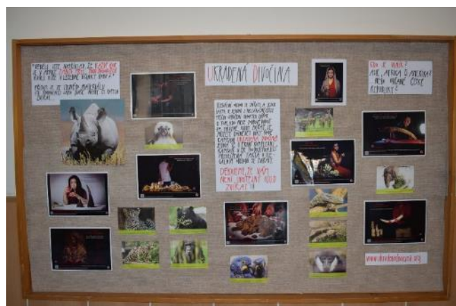
Stolen Wildlife in the Dobrá Elementary School

The entire second series of SW photographs will be launched in early 2020 in cooperation with several other major Czech and foreign organizations (such as Prague Zoo, Safari Park Dvůr Králové, TRAFFIC, WildAid and others). As with the first series of photographs, all the specimens or parts of animals in the photographs of the second series, such as tiger bones, corals, bear bile, poisoned birds, etc., were seized by the control authorities in the Czech Republic. Photo panels of the second series will also be provided free of charge to everyone interested in printing and exhibiting at their institution. The first preview of the 2nd series of SW photographs was published on the occasion of the International Vulture Awareness Day (7.9.), because the new series is aimed, among other things, at threats to the world populations of vultures and their poisonings. The motto of this first photograph is “DEATH HIDDEN IN THE BAIT”. On the topic of vulture poisoning, the SW campaign collaborates with the globally recognized Vulture Conservation Foundation (VCF).