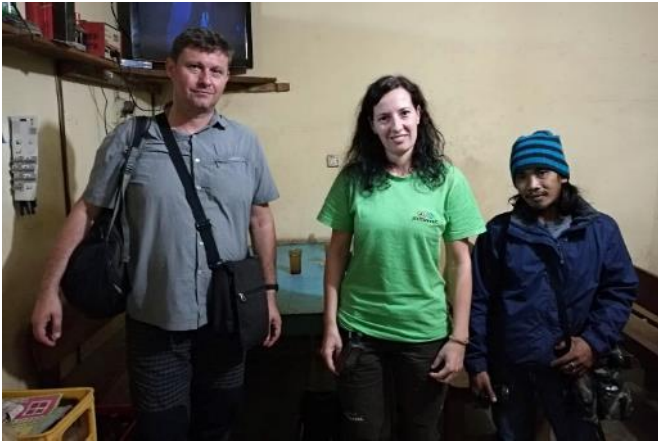
Monitoring team in Kuta Male