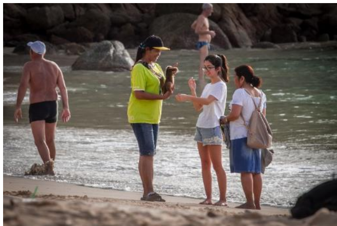
Offering slow lorises for taking photos in Thailand