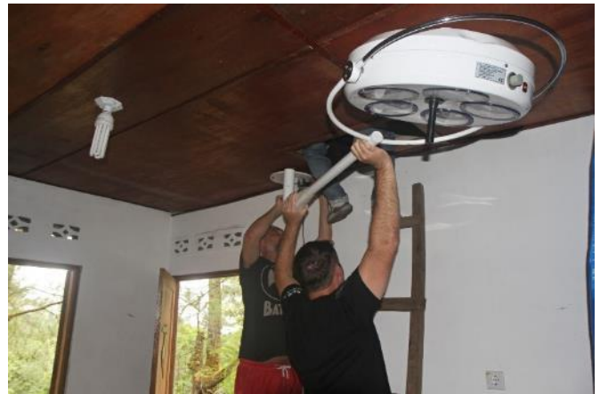
Repair of the surgery lamp in the clinic

Furthermore, the insect farm was expanded, producing a large number of worms. In order to provide slow lorises with the best food possible, we breed darkling beetles ( Zophobas morio ) in our farm. We sell excess larvae of this species on the local market as food for birds and invest the money earned from the sale back into the farm.