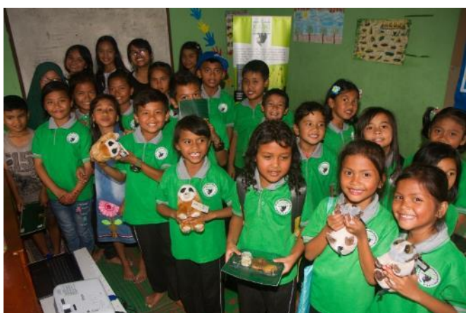
Children from the Bandar Baru school in new uniforms