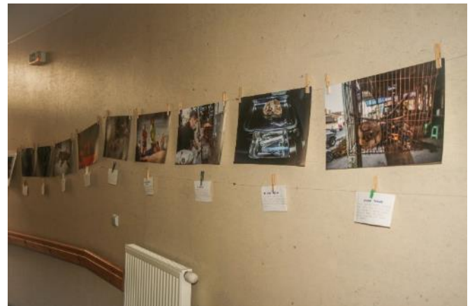
Exhibiton at the Prague Naturalists Station

All these activities could not have been carried out without the support of our partner zoos, such as Ostrava Zoo, Olomouc Zoo, Liberec Zoo, Hodonín Zoo, Wrocław Zoo, and NaturZoo Rheine, and other organizations, such as the Czech Coalition for Biodiversity Conservation (CCBC), Czech Palm Oil Watch, EAZA Prosimian TAG and many others including private companies and individual donors listed on our website. Many thanks to everyone!