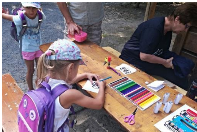
Kukang Day in Olomouc Zoo