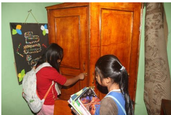
New library for children of Bandar Baru