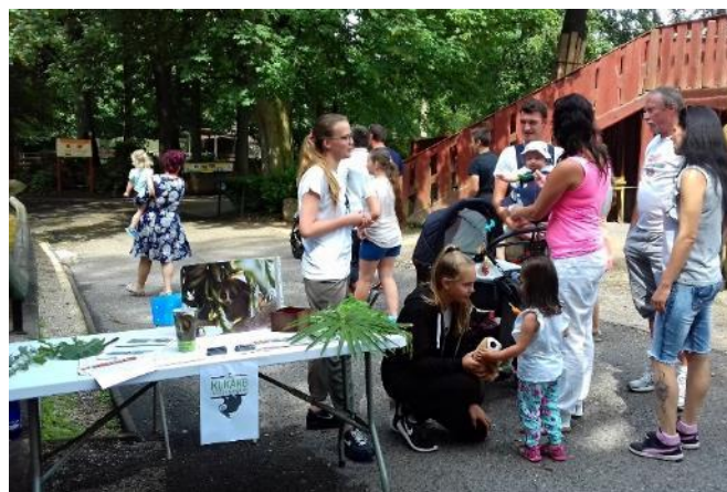
Conservation Projects Day in Liberec Zoo