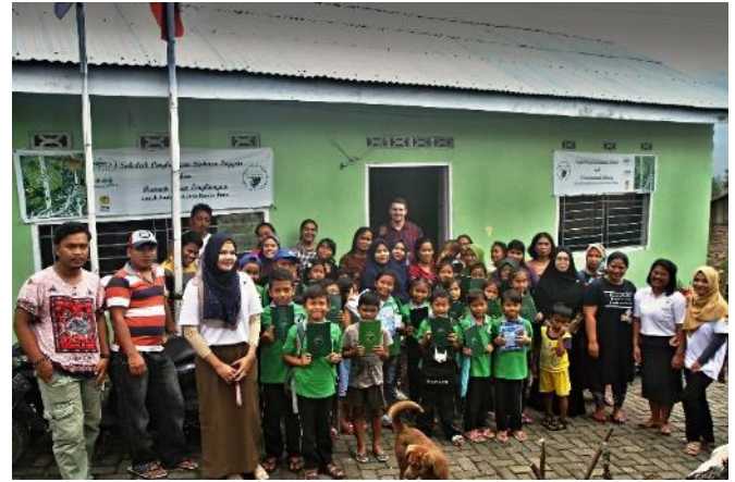
Handover of final reports and awarding the best students Students with final reports with their parents and teachers