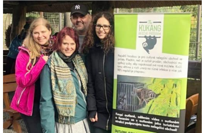
Part of the Czech Kukang team in Dvorec Zoo