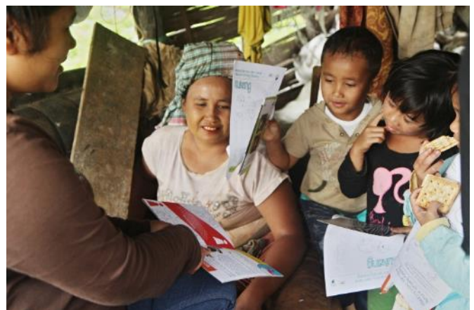
Work of the anti-conflict team in Raja Berneh