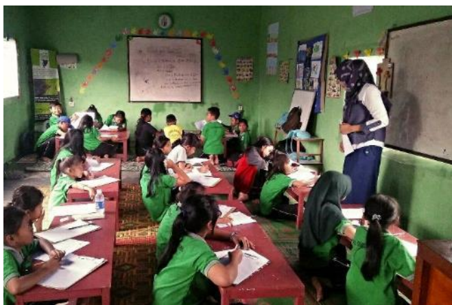
Final exams of children from the school in Bandar Baru