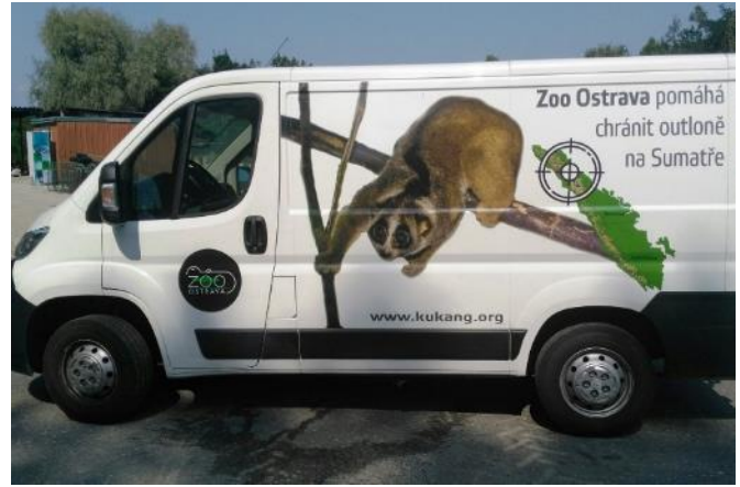
Ostrava Zoo car decorated with the Kukang Program motif