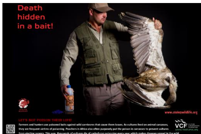
Preview of the 2nd series of SW photographs