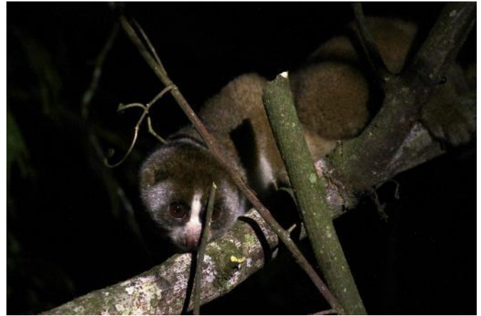
Observing a greater slow loris during the monitoring