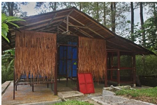
Extended quarantine for slow lorises

In 2019, the program's rescue and rehabilitation centre got extended by several new constructions. The quarantine for slow lorises has been enlarged and one new house (the so-called "pondok") for animal keepers and one for watchmen have been built. A new waterwork with a biological wastewater treatment plant was also created in the centre, where the water undergoes several stages of purification using different layers of material. As part of this construction, the entire centre's piping system, which had been largely damaged and clogged, was replaced. The spring was also cleaned and concreted to prevent further water pollution. Furthermore, reconstruction works were carried out on damaged parts of the centre.