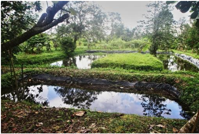
Newly filled pond adjacent to the offices

a shelter and food source for insects, amphibians, reptiles, birds, bats, and other mammals naturally occurring in the centre. These measures implemented in the rescue and rehabilitation centre's area represent a contribution to increasing the biodiversity of the whole locality. Last but not least, it serves as an inspiration for local staff, visitors and children attending the English-Environmental School run by The Kukang Rescue Program adjacent to the centre.