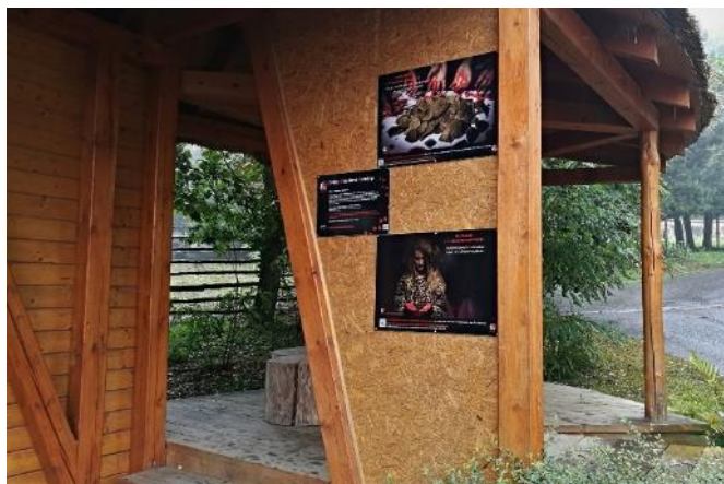
Stolen Wildlife Path in Olomouc Zoo