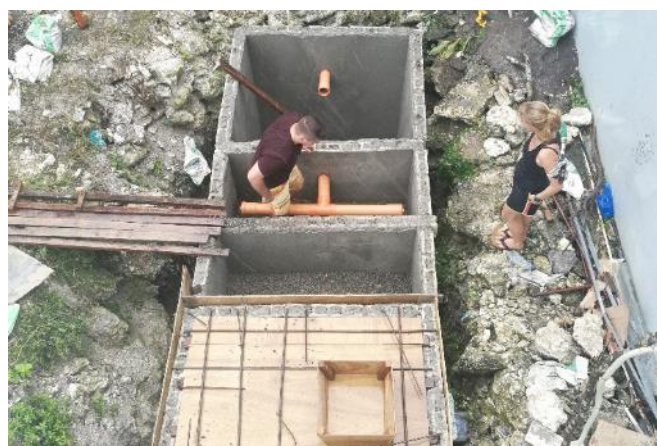
Finalization of the wastewater treatment plant of the Vesna Panglao Conservation