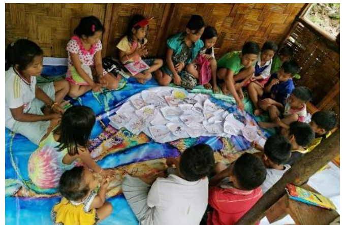
World Pangolin Day celebrations