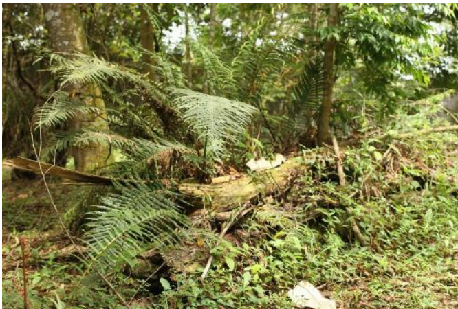
Part of a dead tree preserved for animals