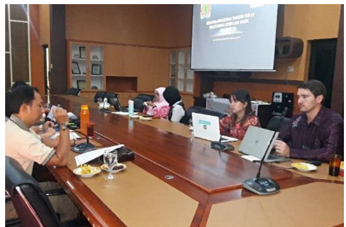
Preparation of an MoU with BBKSDA North Sumatra in conservation of small mammals of Sumatra