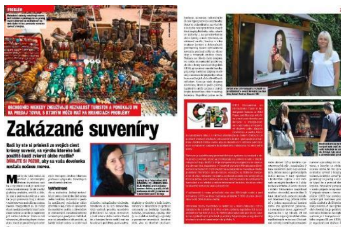
Stolen Wildlife campaign in the Bojnice Zoo in Slovakia