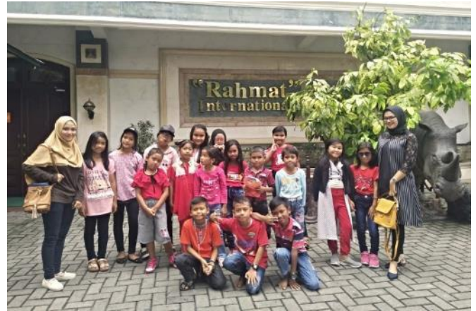
Visit of Rahmat International Wildlife Museum & Gallery

Environmental education and English lessons were also held every day in the Kuta Male Library during the first two weeks of February. On 16 February, the environmental lessons resulted in the celebration of the World Pangolin Day.