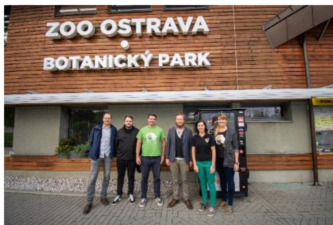
Meeting of Kukang and Plumploris teams in Ostrava Zoo