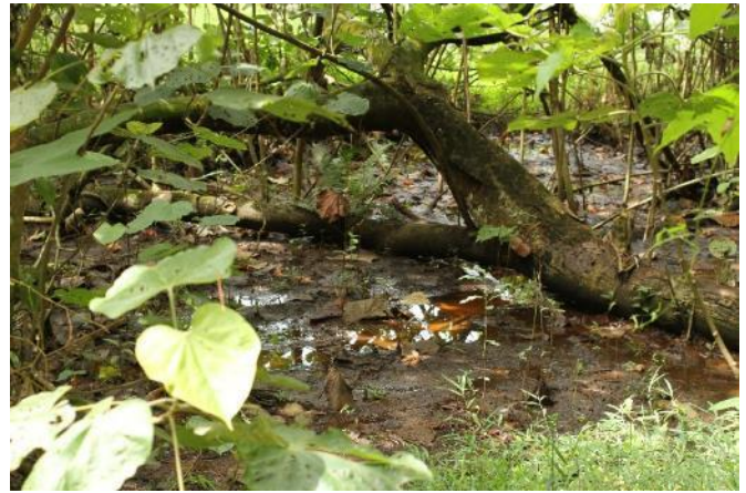
One of the pools in the rescue and rehabilitation centre