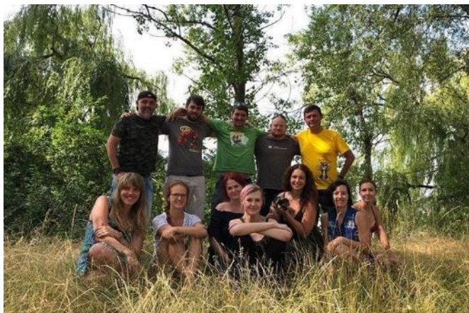
Annual meeting of the Czech Kukang team in Píšťany

Between 19 and 21 July 2019, the General Assembly of members of the Czech organization The Kukang Rescue Program, z.s. for 2019 took place in Píšťany where the past year was summarized and the following year was planned.