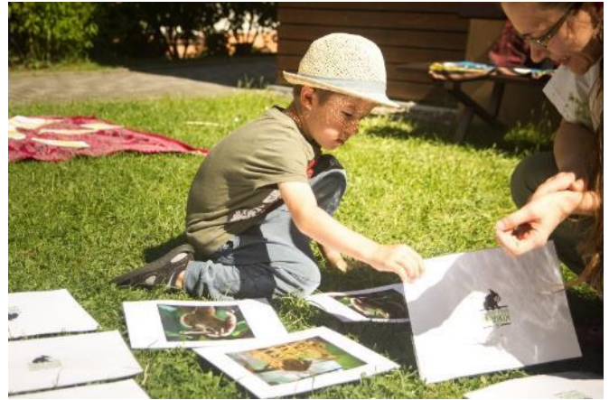
Slow loris games for children at the event FOR A MOMENT WITH KUKANG