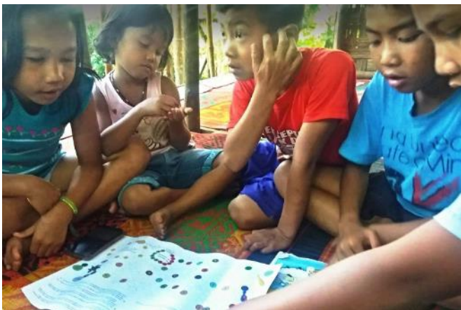
Playing of the slow loris game in Kuta Male

Environmental education and English lessons were also held every day in the Kuta Male Library during the first two weeks of February. On 16 February, the environmental lessons resulted in the celebration of the World Pangolin Day.