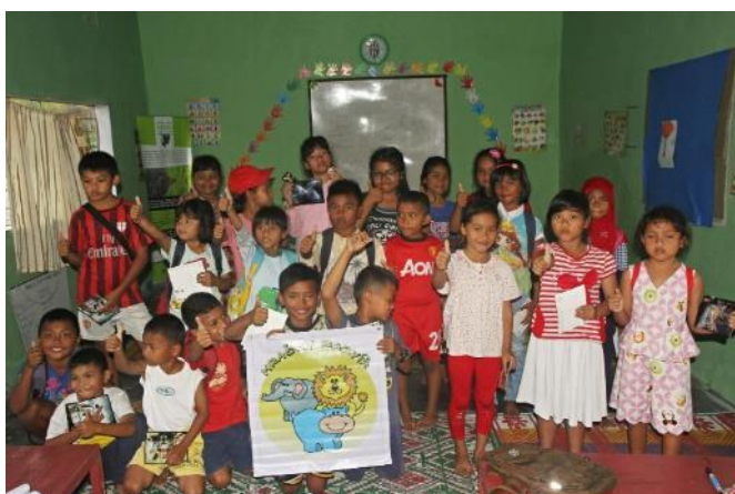
Pupils of our Bandar Baru school with Hračky Barvíř logo

Cooperation with the Embassy of the Czech Republic in Indonesia on the sustainable development focusing primarily on educational and awareness-raising activities and support for local communities has already been mentioned here. In addition, a donated ultrasound and a purchased centrifuge were sent to Indonesia in cooperation with the Embassy. Furthermore, a meeting was held last year on the future cooperation with representatives of the German organization Plumploris. Establishing new strategic partnerships and friendly relationships is very important in the field of nature conservation.